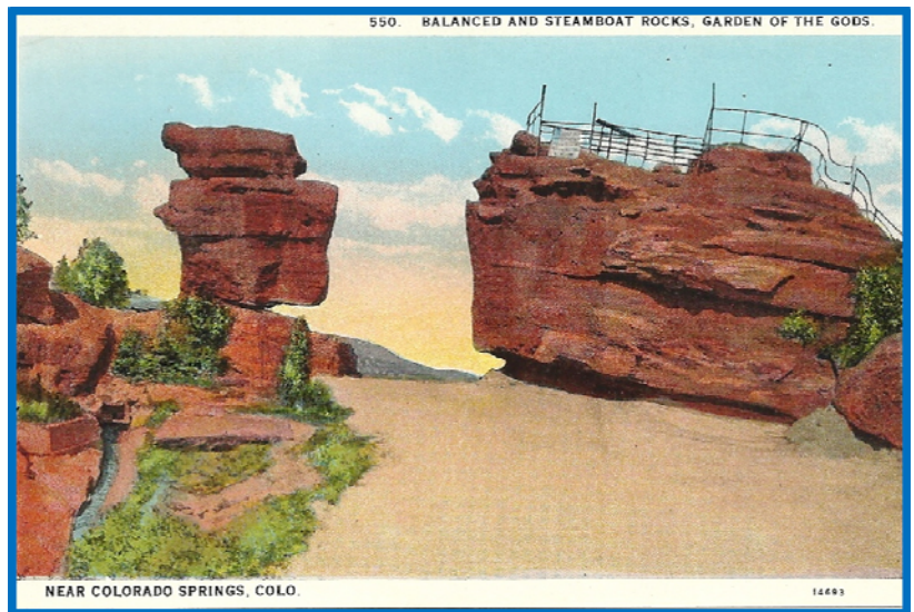
550. BALANCED AND STEAMBOAT ROCKS, GARDEN OF THE GODS.

Late in 1909, the Colorado Springs City Council accepted the land and conditions. Today, Garden of