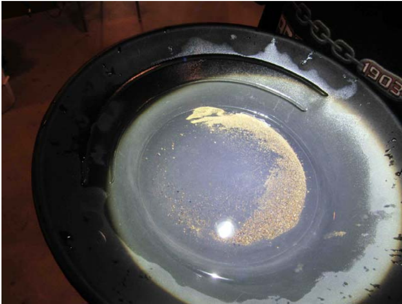
A dream pan! Expertly panned wire gold from a crushed ore sample that assayed at over 2,000 ozt per ton!

on January 11th, but we did find out that Home Depot sand has some very fine gold in it! This is a prospector's urban legend—and the internet is peppered with stories of someone who once found some gold in sand purchased at a big box home improvement store. In our case—we found some very fine gold in our pans that the Gold Cube caught from the sand used in the Cube Off.